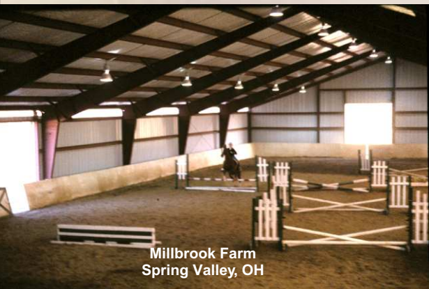
Millbrook Farm Spring Valley, OH