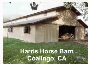
Harris Horse Barn Coalingo, CA

Star buildings can be customized to fit your needs with a myriad of design features. Recessed spaces in the aisles for water faucets, padded walls, rounded inside corners, outside stall doors, and open grills set into dividing walls between stalls are all key features that a Star building can easily accommodate.