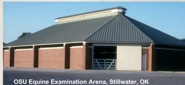
OSU Equine Examination Arena, Stillwater, OK

Column-free interiors provide uninterrupted floor space which could be dirt, gravel, asphalt, concrete, brick, or rubber brick that is commonly seen in walking rings or saddling paddocks at racetracks.