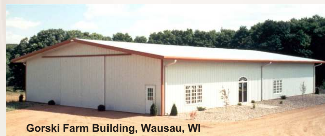
Gorski Farm Building, Wausau, WI