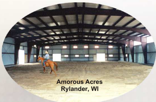
Amorous Acres Rylander, WI