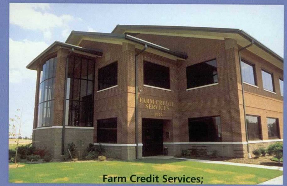
Farm Credit Services; B. B. Vance & Sons, Inc., builder; Stacke and Steiling, architect.

...and provides energy efficiency and lower maintenance costs.