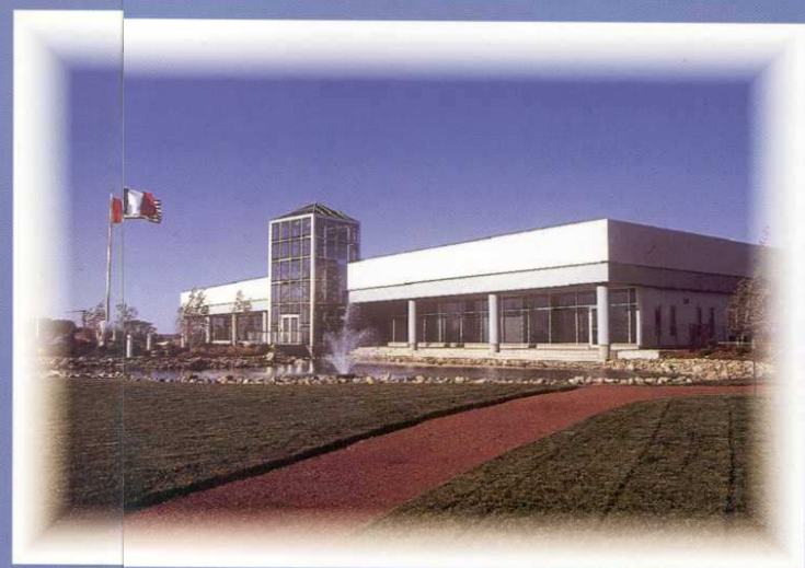
Maui Jim, Inc.; P. J. Hoerr, Inc., builder; Apae Architects & Engineering, architect.

Star Buildings have unparalleled advantages such as faster construction time and low maintenance, as well as design interest and an assortment of exterior veneers that make them an ideal solution for the developer.