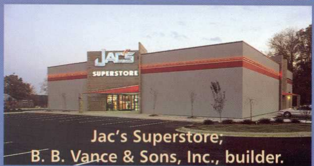
Jac's Superstore, B. B. Vance & Sons, Inc., builder.