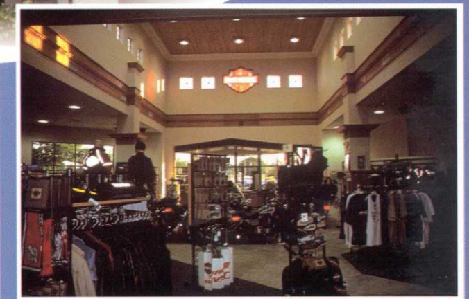
Jim's Harley Davidson of St. Petersburg; P. J. Callaghan Co., Inc., builder; L. R. Penny & Associates, architect.