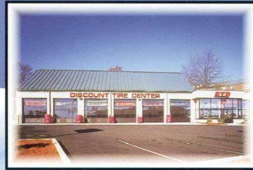
Above, ETD Tire Center; Klae Construction, Inc., builder.

American Awards; Maverick Builders, Inc., builder; Construction Design, Inc., architect.