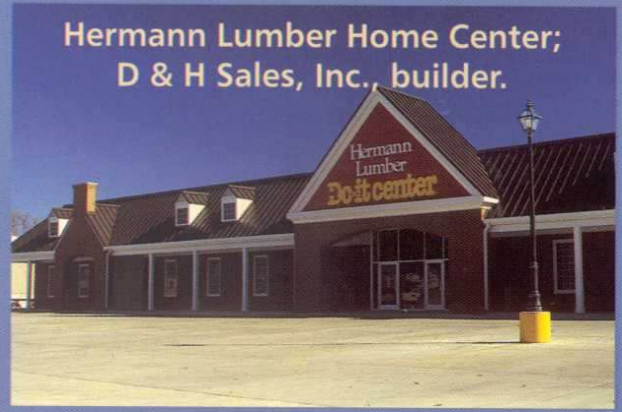
Hermann Lumber Home Center; D & H Sales, Inc., builder.

When it comes to designing your new commercial center, call a Star Builder. They know Star's product and can consult about site selection, specifications, interior design and landscaping. Let them develop a solid plan that includes a Star Building System. Call one today!