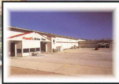
Powell's Lumber Co.; Adams Construction Inc., builder.