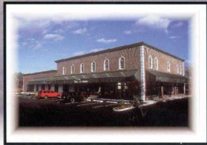
Park Place; Lohr Construction Co., builder.