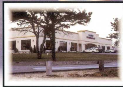
Lazyboy Furniture Gallery; Lohr Construction Co., builder.