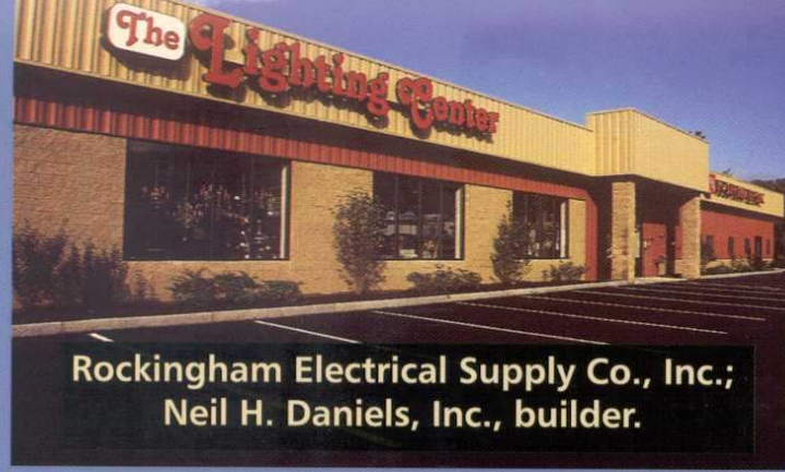
Rockingham Electrical Supply Co., Inc.; Neil H. Daniels, Inc., builder.